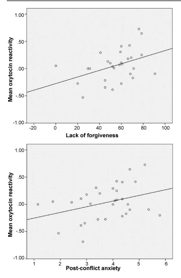
Figure 1 Correlations of mean oxytocin reactivity with: (a) lack of forgiveness (n = 29), and (b) post-conflict anxiety (n = 31). *Note. Raw values of plasma oxytocin were square-root transformed to approximate a normal distribution. Mean oxytocin reactivity values were computed using the transformed values.